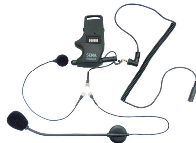
SMH-A0304: Helmet Clamp Kit - For Earbuds with Attachable Boom Microphone & Wired Microphone