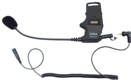
SMH-A0303: Helmet Clamp Kit - For Earbuds