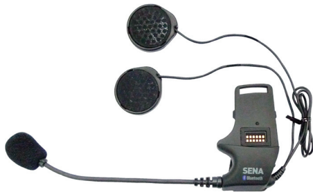
SMH-A0301: Helmet Clamp Kit - Boom Microphone