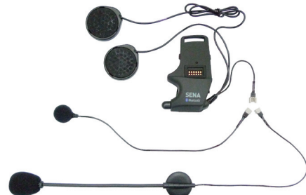
SMH-A0302: Helmet Clamp Kit - Attachable Boom Microphone & Wired Microphone